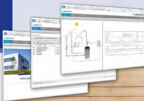
Condition Monitoring im readyM2M-Portal

DAS readyM2M PRINZIP STANDARDISIERT. SICHER. FLEXIBEL.